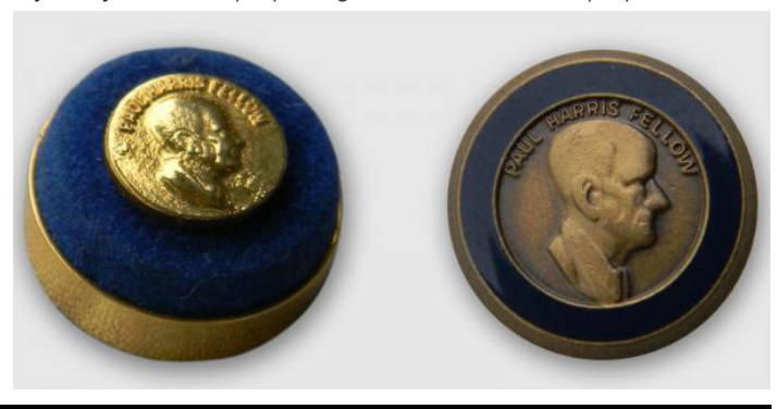
Left: The first men's lapel pin. Right: The second men's lapel pin.