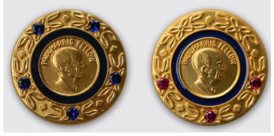
Left: Introduced in 1984, the blue-stone Multiple Paul Harris Fellow pin recognizes additional donations up to $6,000. Right: Red-stone Multiple Paul Harris Fellow pins were introduced in 1988 to bridge the gap between the blue five-stone pin and Major Donor recognition levels.